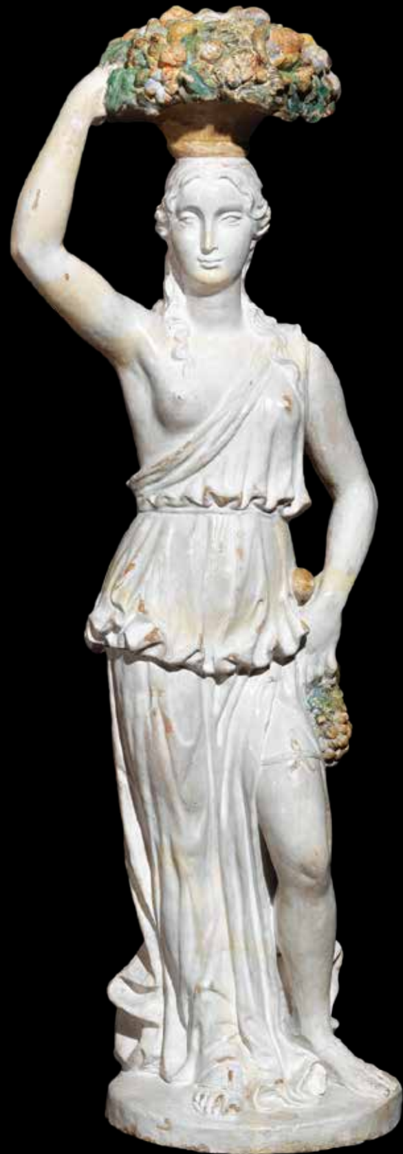
Giovanni Della Robbia Dovizia 15th century Glazed terracotta 82 x 24 x 23 cm Bellini Collection 喬瓦尼·德拉·羅比亞 豐收女神 15世紀 釉面赤陶 貝利尼收藏

展覽的展品進一步展現出在這個創造宗教與世俗圖像的輝煌時代，所採用且發揮得淋漓盡致的藝術材料，如石材、木材及陶瓷。本館衷心感謝路易基·貝利尼先生及羅伯特·麥卡錫先生願意分享其獨一無二的收藏。我們亦對馬可孛羅會、意大利駐香港及澳門總領事館、黃廷方慈善基金、領賢慈善基金及香港大學博物館學會對這次空前的展覽的支持，表達由衷的謝意。