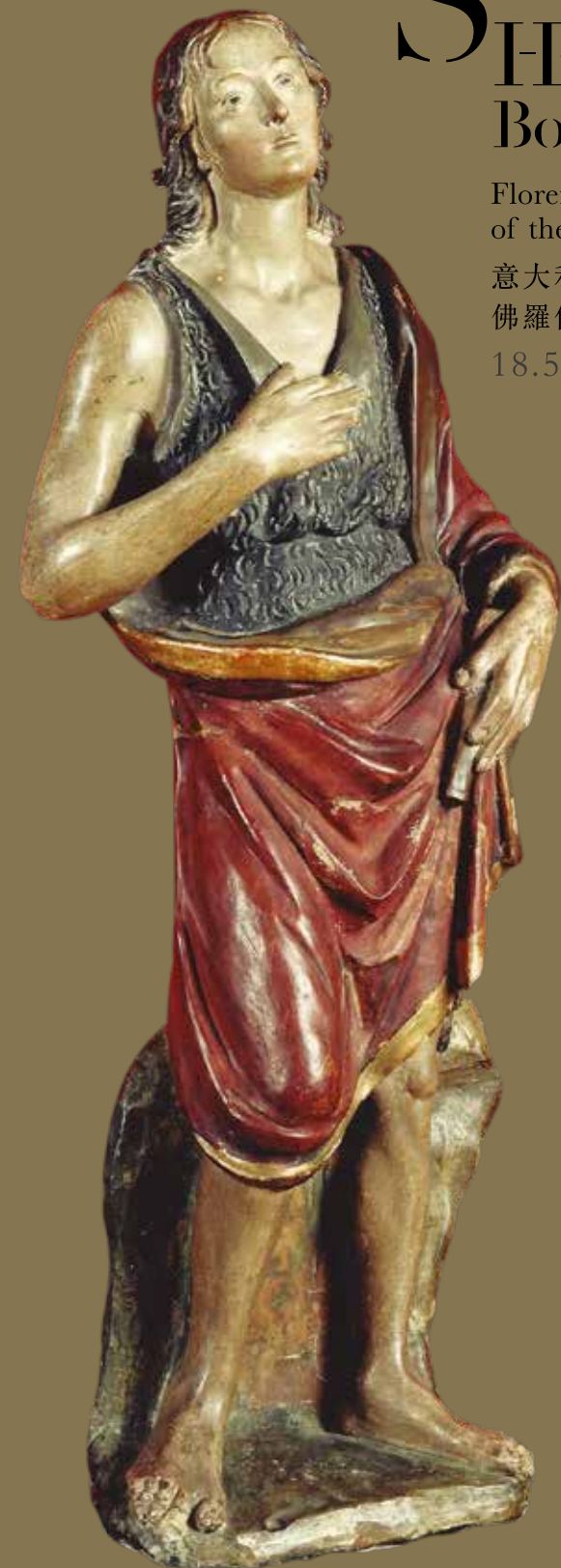
封面 多納泰羅 聖約翰 15世紀 彩繪赤陶 貝利尼收藏