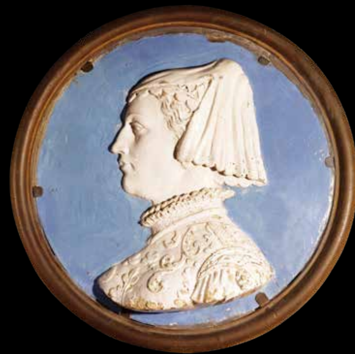
> Luca Della Robbia Lady 15th century Glazed terracotta Diam: 60 cm Bellini Collection 盧卡·德拉·羅比亞 貴婦 15世紀 釉面赤陶 貝利尼收藏