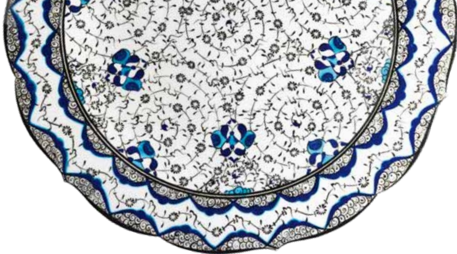
PLATE WITH GOLDEN HORN PATTERN