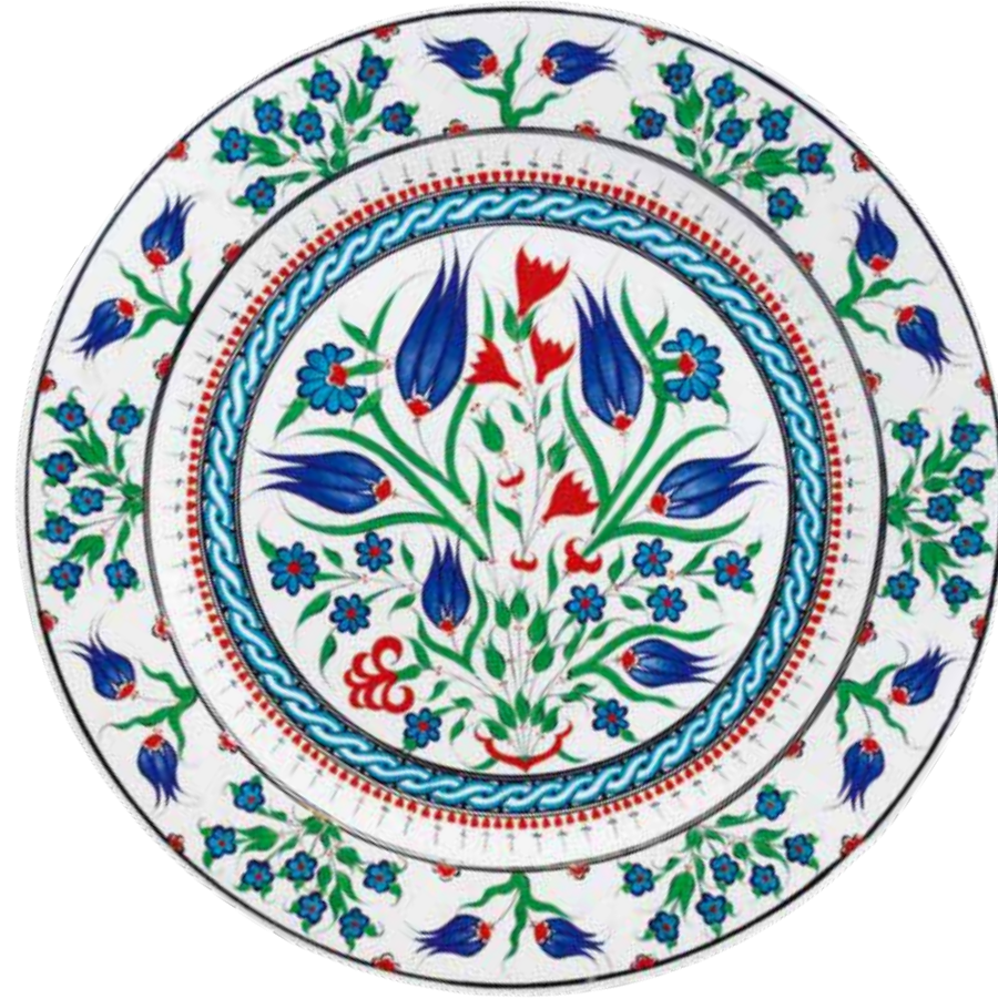
PLATE WITH TULIPS

伊茲尼克陶器得名於伊茲尼克鎮。當地自 15 世紀的最後四分之一世紀起，已燒造出裝飾亮麗的陶瓷。本地工匠將簡單的陶器製作，發展成以鈷藍彩繪花紋、施無色釉、精緻而優質的陶瓷。