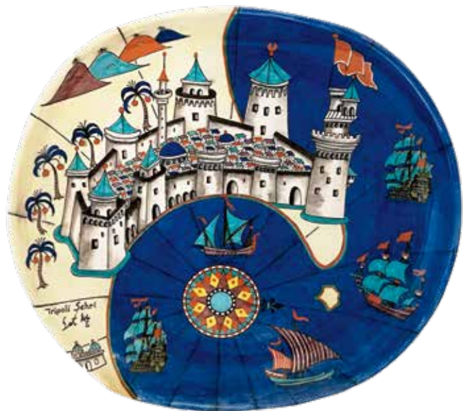
PLATE WITH 'PİRİ REİS' MAP DESIGN

Nida Olçar, 2003 Sıtkı Çini, Kütahya Fritware with underglaze decoration